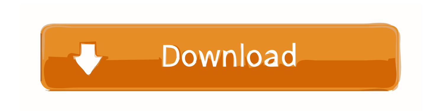
X Force X32 Exe Inventor Engineer-to-Order 2014 Crack